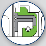
Rex® Z Seal Non-Contact Seal