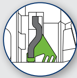
Rex G Seal Triple Lip Seal