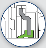
Rex K Seal Light Contact Seal