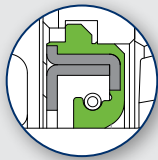
Rex M Seal Heavy Contact Seal