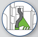
Link-Belt E7 Seal Triple Lip Seal