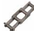
Link-Belt and Rex Engineered Steel Chain, Bucket Elevator and Conveyor Chain