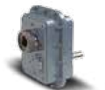
Falk® Quadrive® Shaft-Mounted Gear Drives