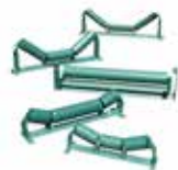
Rex® Conveyor Idlers